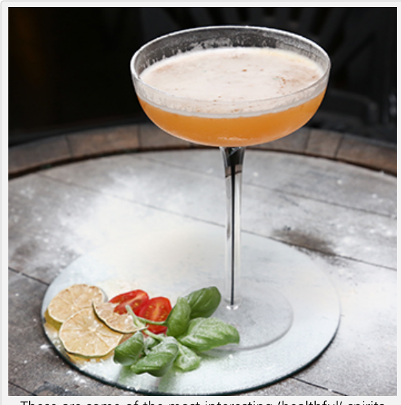
These are some of the most interesting 'healthful' spirits initiatives in the industry